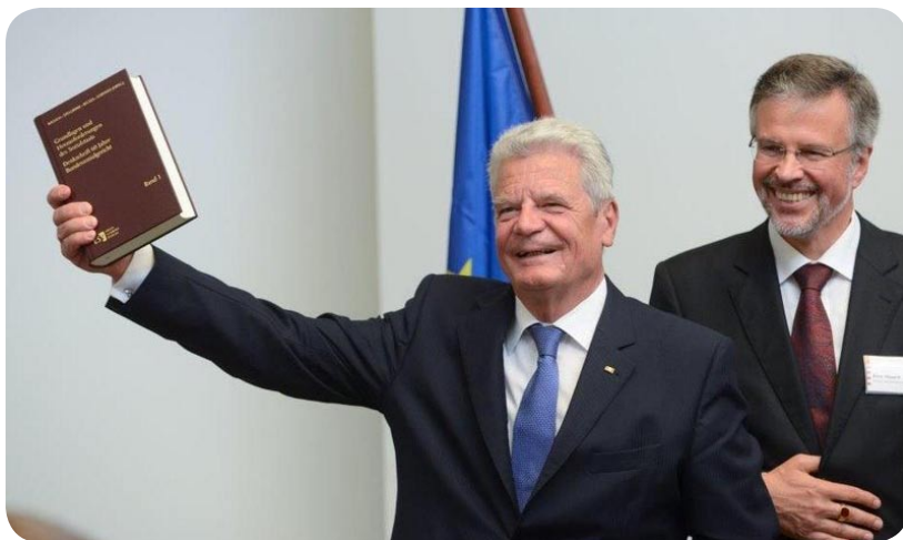
Federal President Joachim Gauck with the Social Policies Memorandum