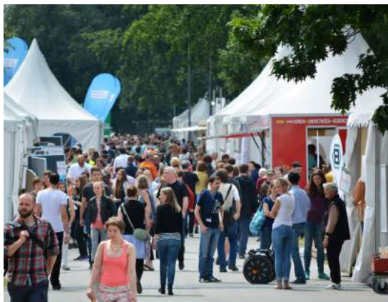
OPEN CAMPUS 2015