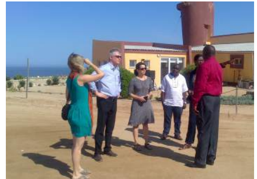
Delegation in Henties Bay