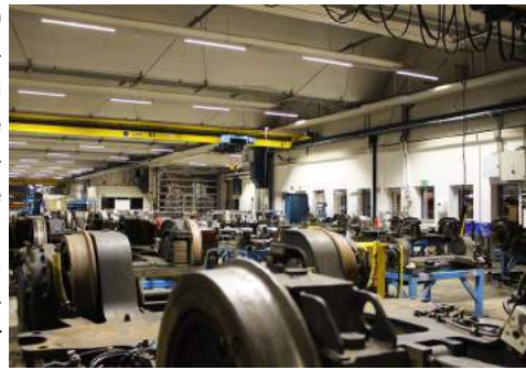
In the workshop of the BSAG

now up to 300,000 people daily since 1876. Holding 99.11 percent, the municipality of Bremen is almost the only shareholder. Because which entrepreneur nowadays can offer assurances for 22.5 years into the future? Bremen provides security for staff members and draws up ambitious plans for the future of the company. No matter if it is about trams, buses, mini-bus tours in the city center, or the design of new transportation hubs, tram or bus stops, or connecting new districts – urban development is supported actively and in a modern fashion. To accomplish that, professional servicing, maintenance,