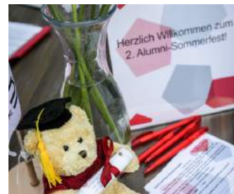
From the archiv: Second Summer Fête

NOTICE: Please feel free to bring your partner or guest to our event. Costs are 15.00 Euro per person. Please register via our Website an. /MB