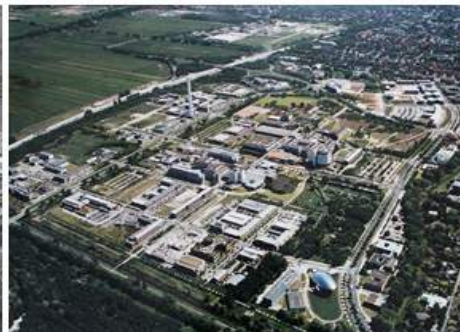
Aerial view of campus 2010

Also at Emmy-Noether-Straße, a new building for the Fraunhofer Institute ME-