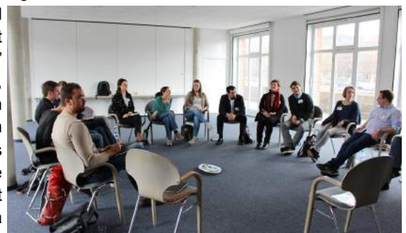
Participants of the workshop