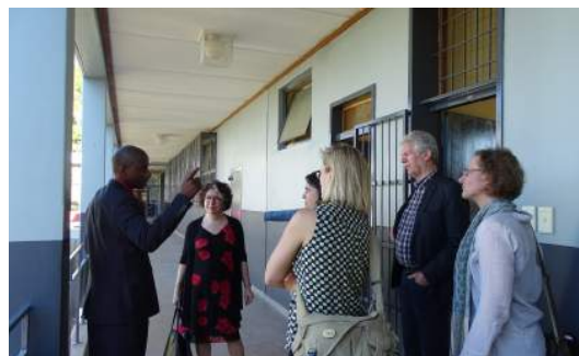
Delegation visiting the Augustineum

At UNAM, numerous meetings were held with the departments involved. They took place at the Windhoek location and in Henties Bay (a campus overlooking the coast), home of the Fisheries and Aquatic Sciences Department, as well as on the campus of the Faculty of Engineering in the north. In them, future collaborations in research and teaching were discussed thoroughly. The talks were promising, as many common interests in research and teaching as well as many starting points for future projects were detected. The ob-