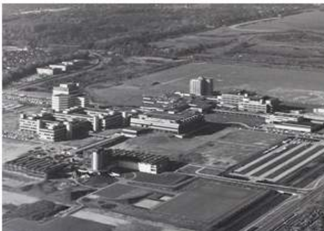
Aerial view of campus 1980

however, is situated between the spur route Autobahnzubringer Universität and the Universitätsallee ('Uni Südwest'). This is where the Aldi real estate management is building a supermarket with a parking garage and office spaces on the upper floors as well as another building that combines office facilities upstairs with retail spaces on the ground floor. There had been a national tender which Aldi won – now, many university staff members, students, and people working in the technology park will be able to enjoy the new infrastructure.