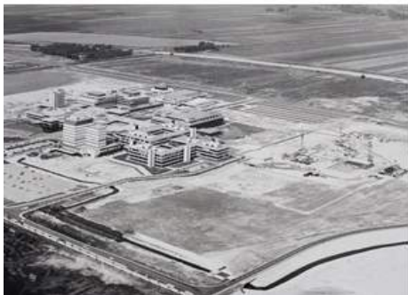
Aerial view of campus 1977

The many construction sites on campus are more than obvious. Something is going on in Bremen! Quite a lot, in fact. The alumni staff insisted on asking Hans-Joachim Orlok (Head of the Property Management and Building Department) for a phone interview.