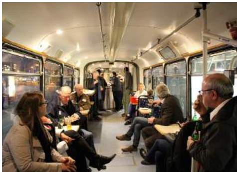
Partitour with the BSAG

refurbishing, and a service workshop are necessary, the latter of which our alumni also toured with interest and excitement. Mr. Rode and the technically competent staff members on duty answered all questions on the many different individual trades that are under the same roof at Flughafendamm. With a shop for everything from the upholstery to the paint shop, BSAG can completely maintain and equip its vehicles. The trams itself are bought ready-made and are then equipped with the city-typical features (color, front, etc.). The interior design is selected by a panel of guests and people with disabilities, so that everything works out and every passenger can be transported optimally as well as safely. Being on tour with the alumni of the University of Bremen has, once more, moved us and has additionally given us exciting insights into the heart of the mobility of our city. /MB